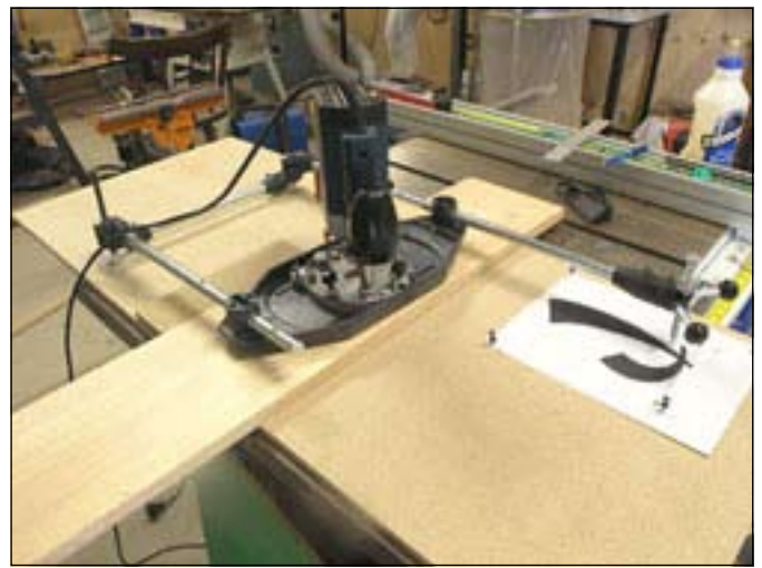
The router pantograph set up and ready to go.

Once your pantograph is assembled and you have it sitting on your mounting board, you then have to square things off, basically so the router plate is sitting as flush as possible with the surface of your sign board piece. You will need to complete these steps each time if you use different thickness boards for your signs. If you use the same thickness, then you really only need to do this once, but an occasional check won't hurt either. Basically, with the router secured in the router plate, sit the plate on top of the board you are using for your sign.