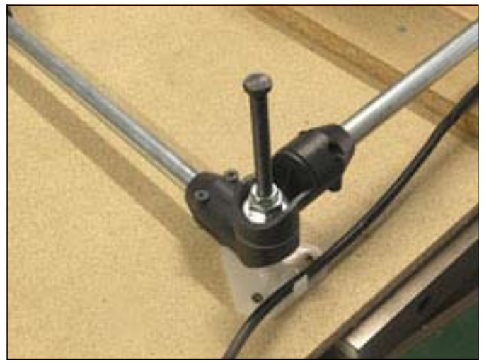
The only fixed part of the pantograph is the plastic pivot base. Note it also has a power cord retainer to keep your router power cord out of the way when in use.