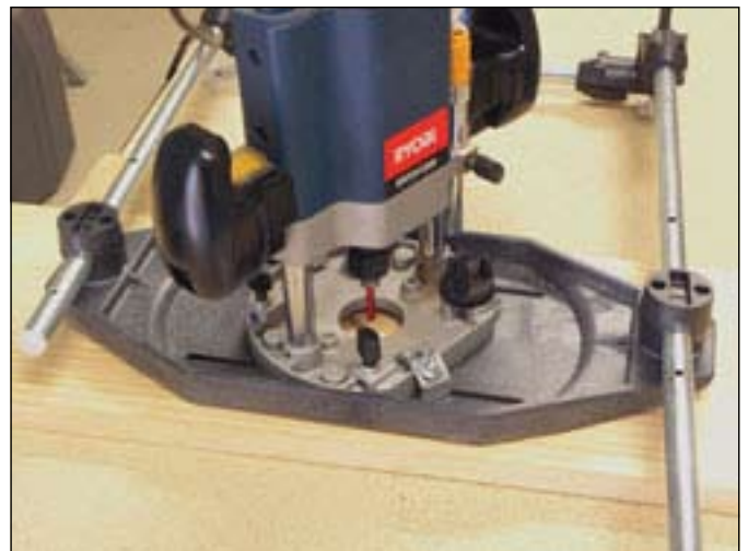
Only a small router is required for this type of work. My 1200w Ryobi handles it no problem.