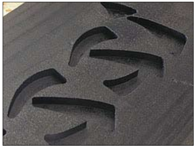
Here is a sign for my daughter Jessica. Note I have painted it black here, but more importantly, the letters were all routed out properly this time around.