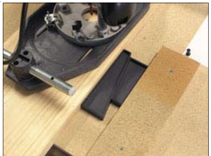
The two plastic wedges are an extremely effective clamping system for the sign board.