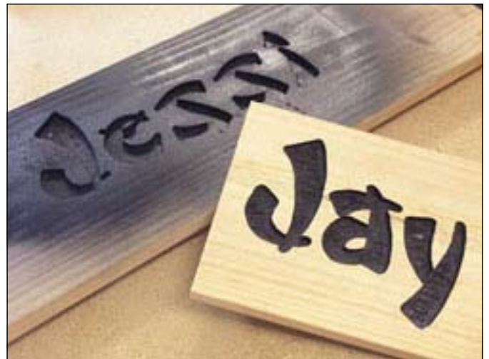
The finishing process. The "Jessi" sign lettering is spray painted. The "Jay" sign was sprayed just like the "jessi" sign, but has now been run through the surface planer to remove the face paint leaving nice, sharp painted edge letters. Easy!