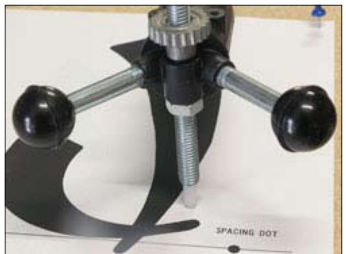
The tracing arm/rod. The rounded plastic tip prevents the paper templates being damaged.